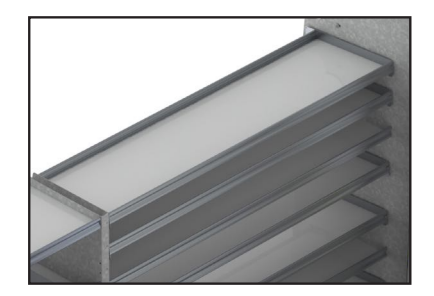
ADAPT TO MARKET NEEDS

Ranger Design focused on developing a custom storage solution that would reduce back injuries by improving access to products and tools in all fleet vehicles.