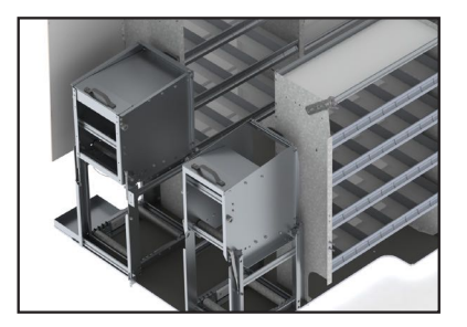
REDUCE BACK INJURIES